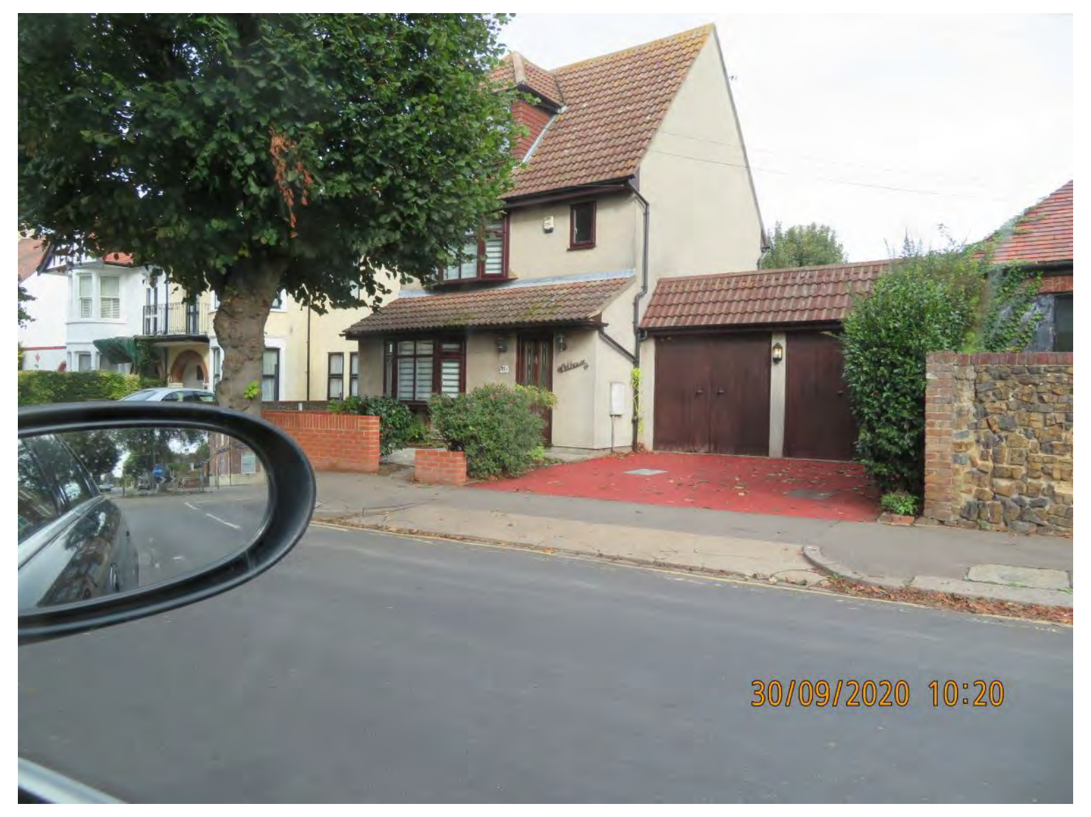
Neighbouring property to the west