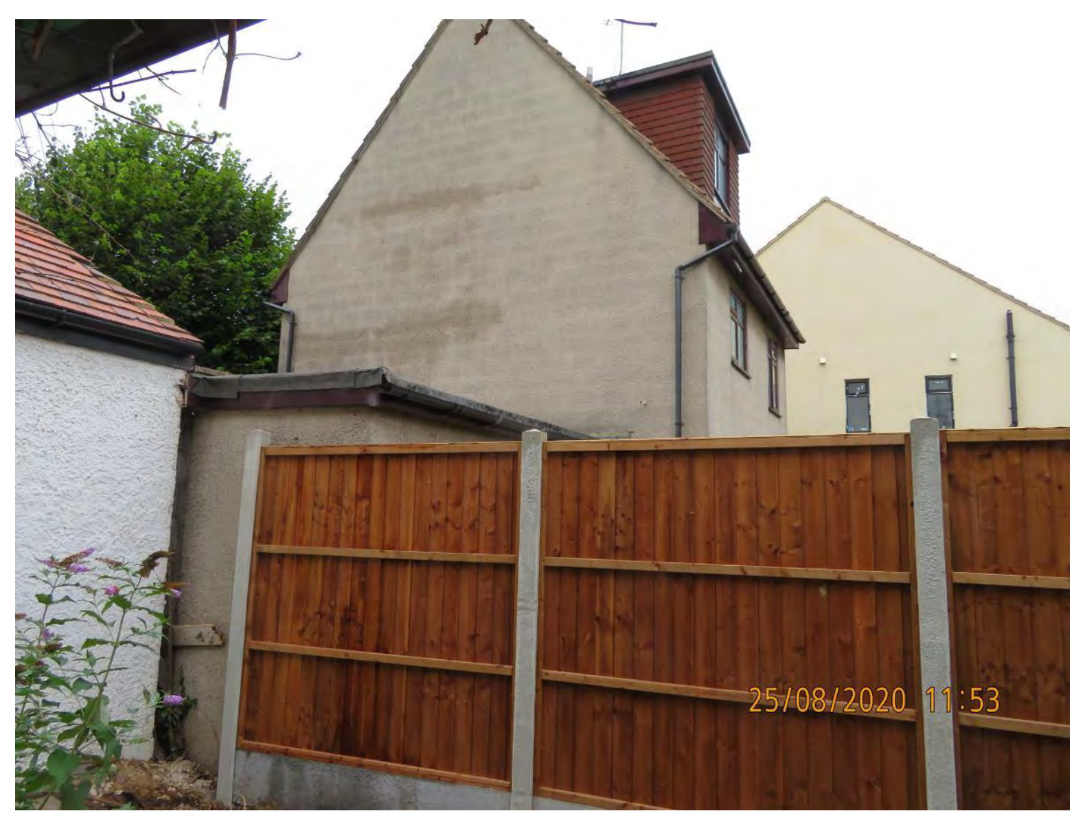
View towards the west from the site