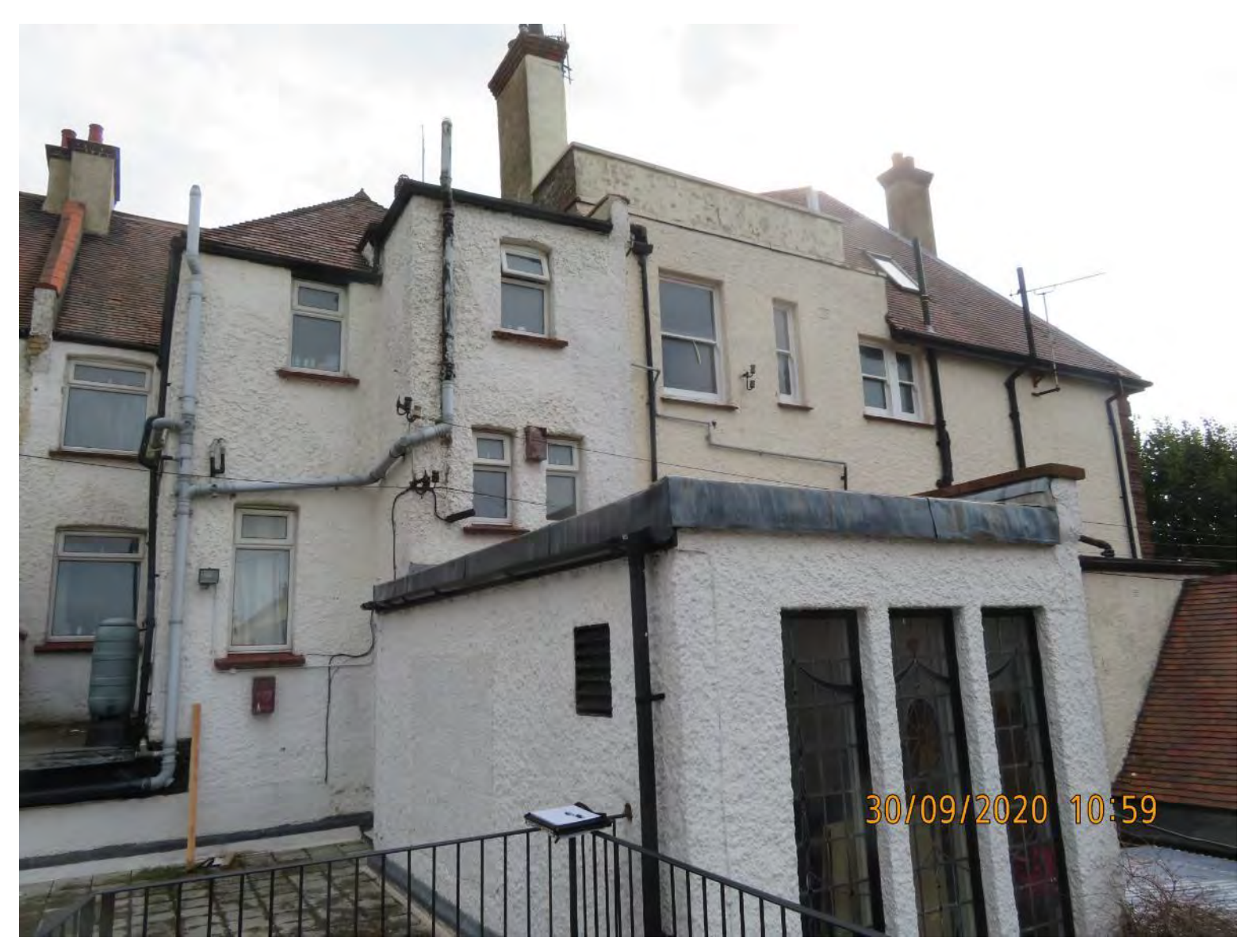
The rear of the neighbouring property to the north