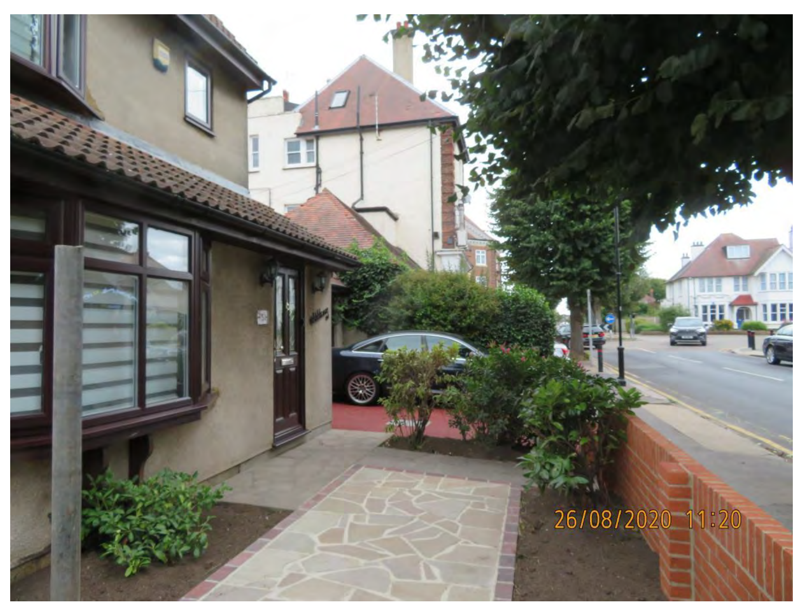
View of the site from the west