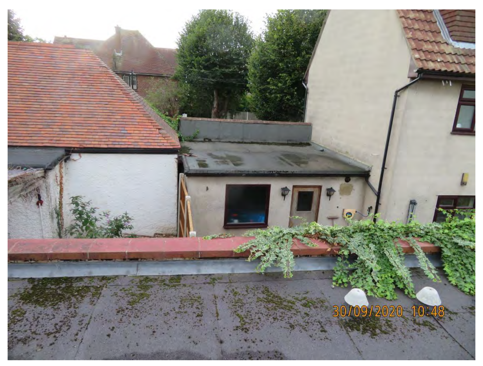
The relationship with the western neighbour from the rear