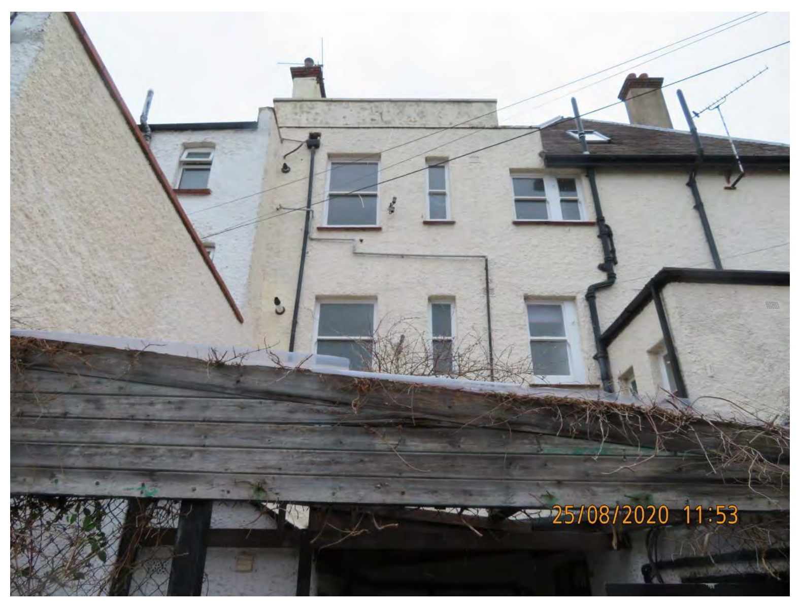
Rear of existing building